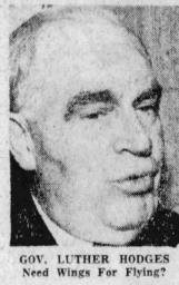
GOV. LUTHER HODGES NEED WINGS FOR FLYING?